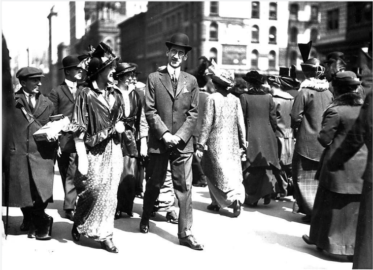
New York 1913 Easter Sun 5th Ave #1878

In 1933, songwriter Irving Berlin immortalized the 5th Ave. parade in his song "Easter Parade." This remains one of the best known Easter songs of all time. By the late 1940's, the famous Easter Parade expanded out of 5th Avenue and extended from Madison Square to Central Park, and it continues today. To this day, shops in 5th Avenue have displays of Easter Bonnets in their windows. The shops compete to see who has the best display and the windows are a tourist attraction.