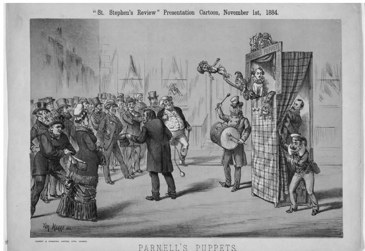
'Parnell's Puppets', printed for the St. Stephen's Review Presentation Cartoon, November 1st, 1884, London. Museum no. S.1291-2010. Note: Punch is the puppet holding a stick, disposing of the other puppets!