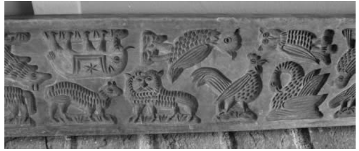
Antique wooden cookie board

Unique cookie shapes were first introduced in Germany in the Middle Ages through cookie boards: carved slabs of wood with religious designs. Germans invented 'Lebkuchen,' or gingerbread, a spice-filled molasses recipe perfect for a time when white sugar was limited and extremely expensive. They pressed the dough onto the cookie boards to add some style to their creations. Gingerbread men came later, when Queen Elizabeth I of England had gingerbread molded into the shapes of her favorite courtiers. Germans also began decorating outdoor trees with cookies in the 1500s, likely as both decoration and food for animals. This was a very early step towards the modern Christmas tree first fashioned in the 19th century. Of course other countries also had their own cookie recipes: