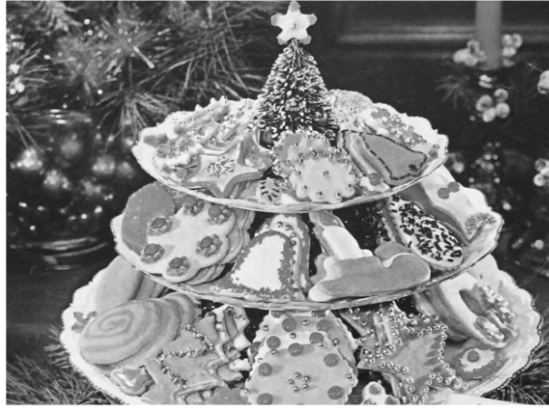
From a 1960's ad for McCormick-Schilling

Cut-out sugar cookies can be traced back to mumming, a Christmas tradition in colonial regions where the Church of England was influential. Christmas stories were acted out and food was used to help depict the tales being told. Yule dows were cut-outs made in this tradition, often in the shape of the baby Jesus.